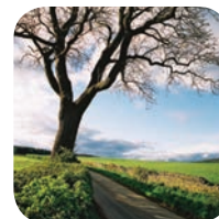
Scenic views around Ashbourne