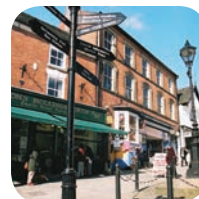
Ashbourne town centre